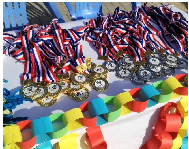
Medals for students